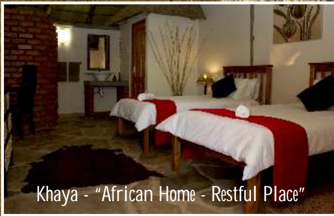
Khaya - "African Home - Restful Place"

Only 90 minutes from the international airport near Windhoek, you'll find a home at Khaya Guesthouse in the garden town of Okahandja. Leave the bustle of the city behind you and overnight with us before leaving for Etosha in the north or the Namib desert coastal towns to the west.